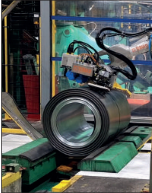
Fig 2 Robot applying strap to coil