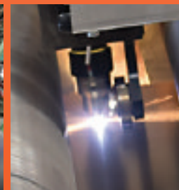
Product Handling & Specials