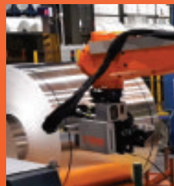
Destrapping of High Strength Steel Straps