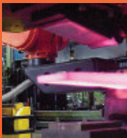
Sample Plate Handling