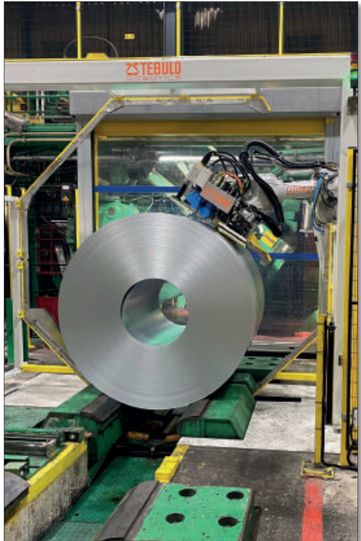
Fig 1 Coil positioned ready for strapping

The pit in which the coil car moves is now fully separated from the area where the robotic machines operate, eliminating the tripping hazards in the old setup. Roos adds: “Even though these optimizations are a significant improvement, we naturally also encountered real challenges. Because the distances between humans and robots are very small, we had