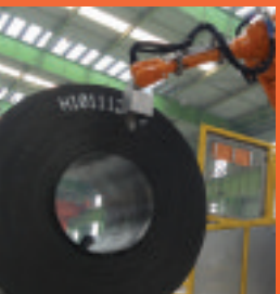
Marking & Labelling Coils & Slabs